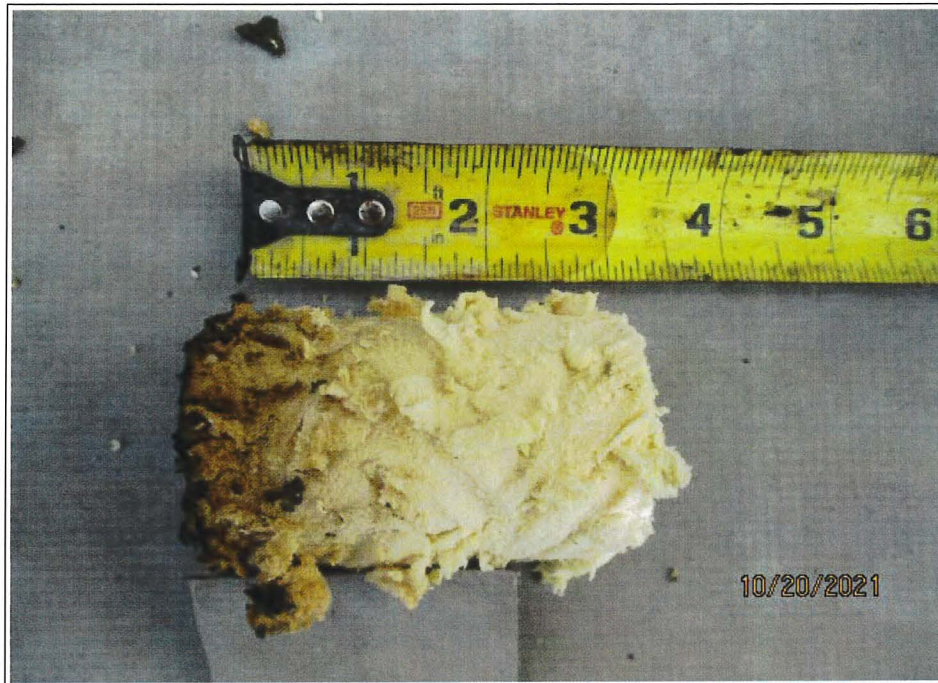
8. VIEW OF ROOF CORE ON AREA "F"