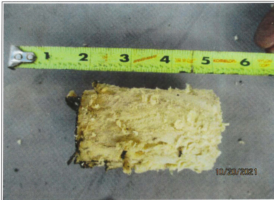
4. VIEW OF ROOF CORE ON AREA "B"