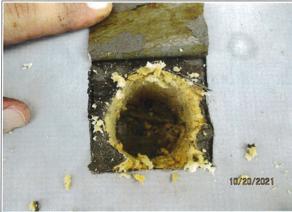
3. VIEW OF ROOF CORE ON AREA "B"