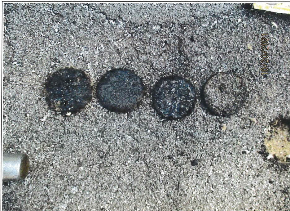
6. VIEW OF ROOF CORE ON AREA "C"