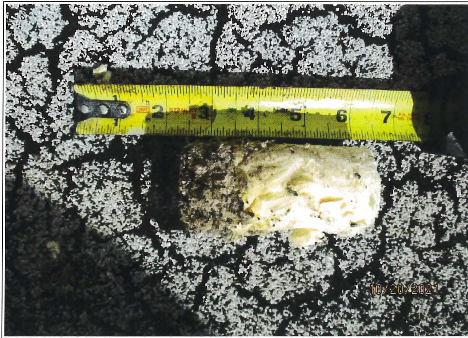
7. VIEW OF ROOF CORE ON AREA "D"