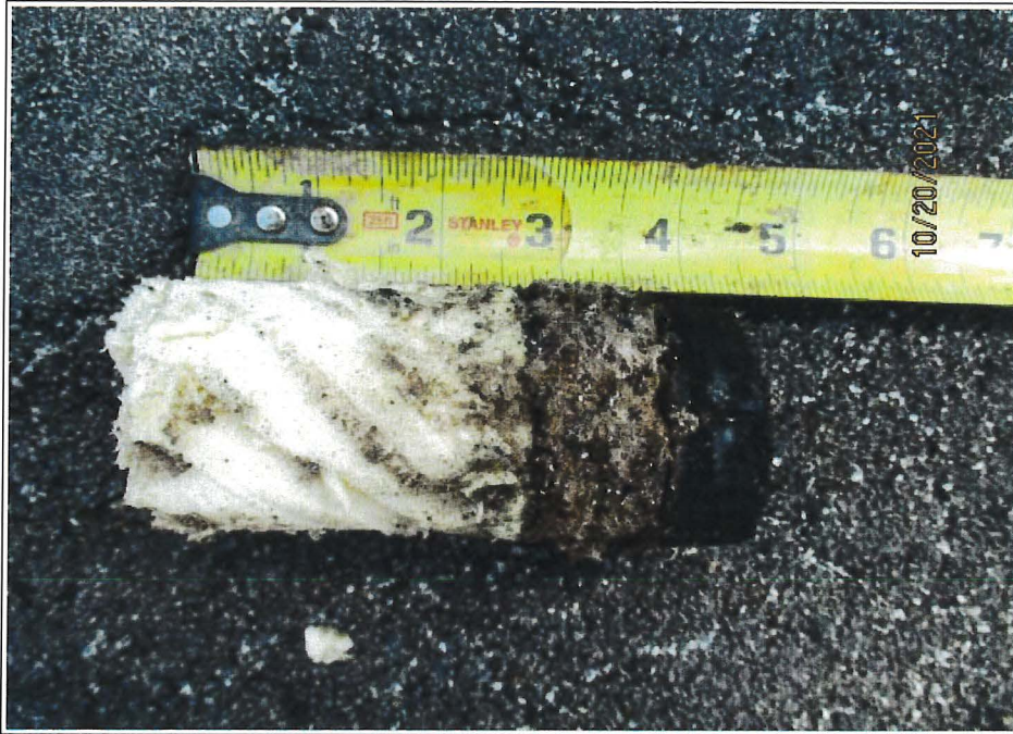
5. VIEW OF ROOF CORE ON AREA "C"